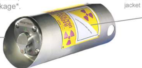
The exposure device, alone, continues to be a compliant Type B package even if the jacket has been removed*

The welded main body houses the source assembly safely stored inside a titanium 'S' tube within a depleted uranium shield