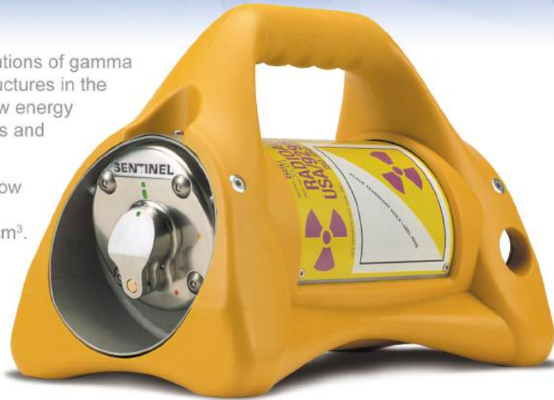
Comfortable carrying handle with slip-resistant contoured grip